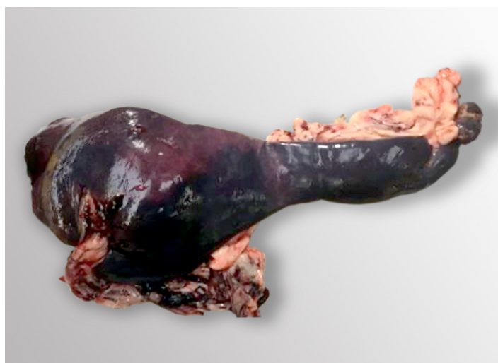
Tail of the spleen with a mass. Head of the spleen appears grossly normal.

Dale had a splenectomy to enable histologic evaluation of his entire spleen which was submitted to IDEXX Pathology as a Complex Biopsy (7217). Upon receipt at the lab, the IDEXX histopathology technician performed a gross examination of the spleen and determined from which areas to obtain sample sections with the goal to obtain representative samples of the entire organ. In the image you can see that the different regions of the spleen have a varied appearance. This is why organs such as the spleen should be submitted whole using the Complex Biopsy test code.