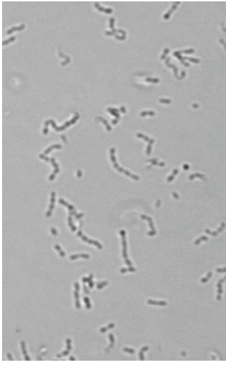
Figure 2. Identification of bacteria on urine sediment, from left to right, rods, cocci in chains.